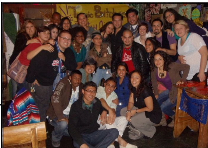
Women's Studies Students and the Cast from Tragic Bitches

Eleanor Roosevelt & the Future of Human Rights